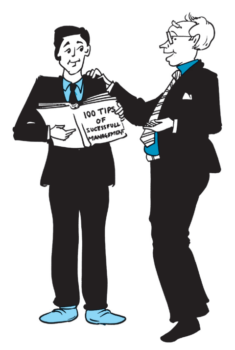
"You don't learn management from books alone..."

managers. They are subordinate to top managers and superior to the first line managers. They are usually known as division heads, operations manager or plant superintendent. management is responsible for implementing and controlling plans and strategies developed by top management. At the same time they are responsible for all the activities of first line managers. Their main task is to carry out the plans formulated by the top managers. For this they need to: (i) interpret the policies framed by top management, (ii) ensure that their department has the necessary personnel,